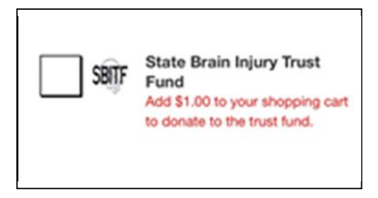
Why is this important?

The TBIAB is very appreciative of the efforts of legislators and state leaders at the Maryland Department of Transportation and the Maryland Department of Health for the creation of a revenue source for Maryland's Brain Injury Trust fund. The Maryland Department of Transportation created a voluntary donation option for vehicle registration transactions completed via kiosk or online. Donations are transferred to Maryland's Brain Injury Trust fund, managed by BHA. Revenues are not yet sufficient to support the types of services identified in the law.